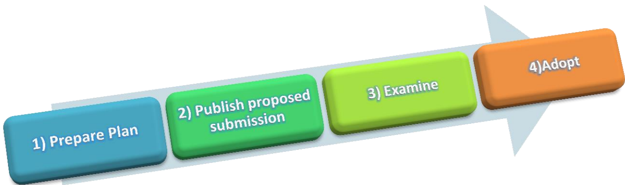
Figure 2: Stages in preparing the Local Plan

4.11 Arrangements for consultation will depend on which stage the plan has reached (see Figure 2). These arrangements are summarised below. References to regulations relate to the Town and Country Planning (Local Planning) (England) Regulations 2012.