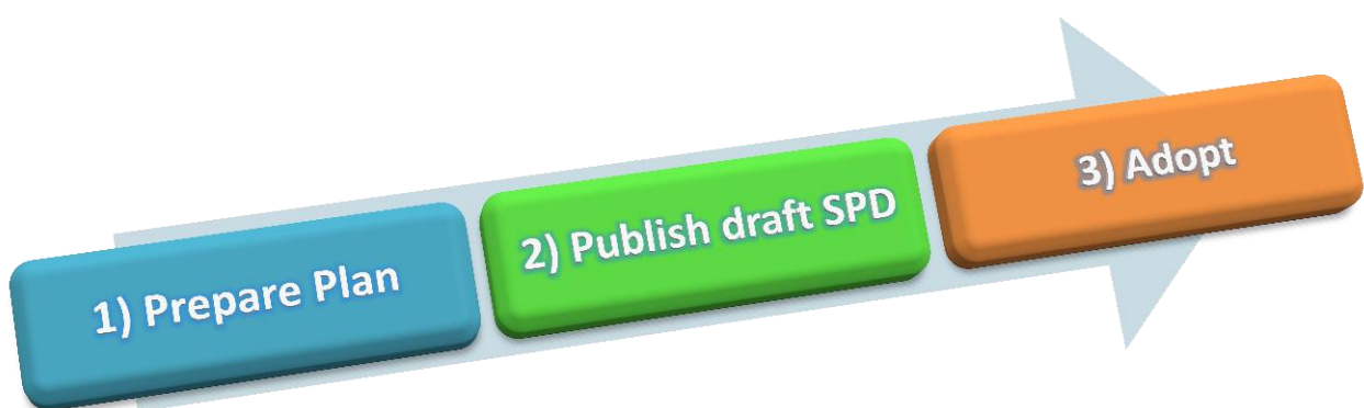
Figure 3: Stages in Supplementary Planning Documents

4.13 Figure 3 below identifies the stages used in the preparation of Supplementary Planning Documents. References to regulations relate to the Town and Country Planning (Local Planning) (England) Regulations 2012.